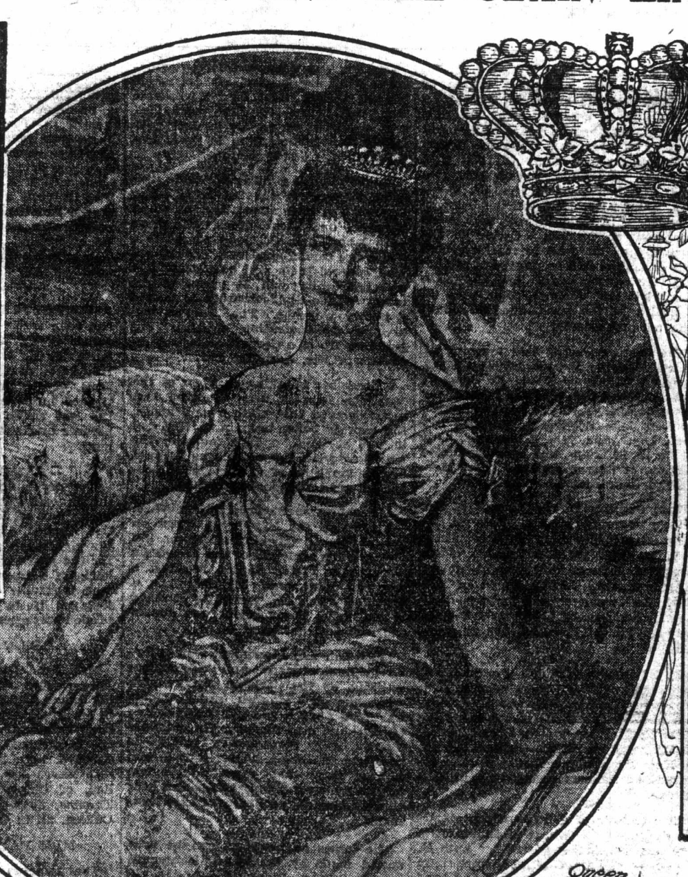
Manuel, the New King.