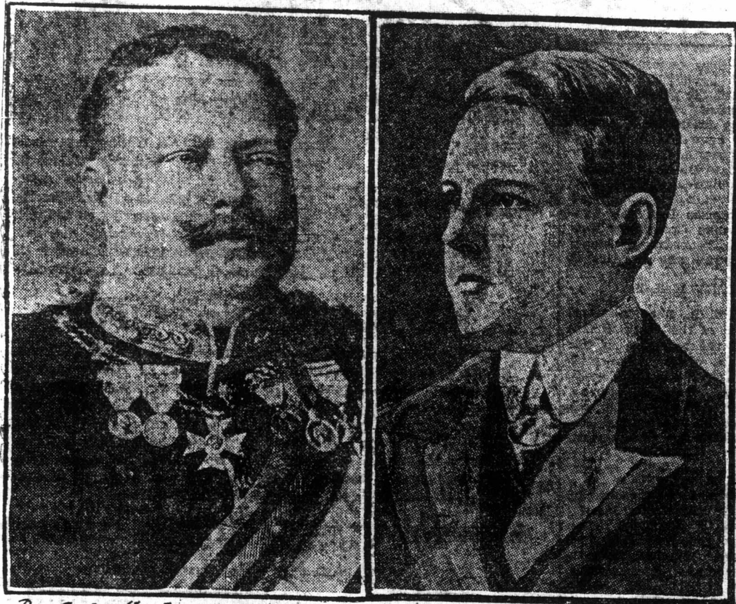
Dom Carlos, the Assassinated King.