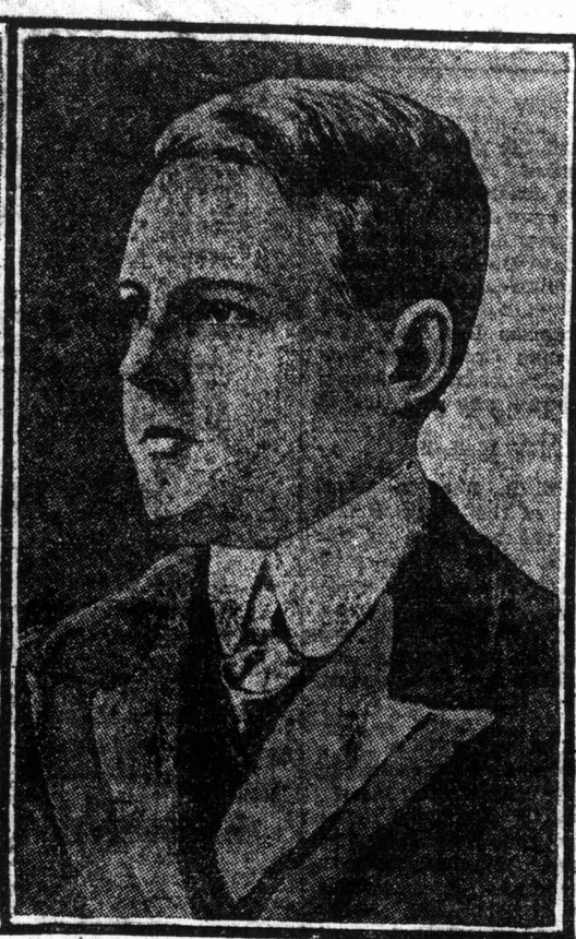
Luiza Philippa, the Crown Princess.