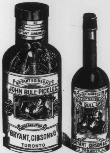
This is a facsimile of our bottles.

BRYANT, GIBSON & Co., TORONTO, Manufacturers of