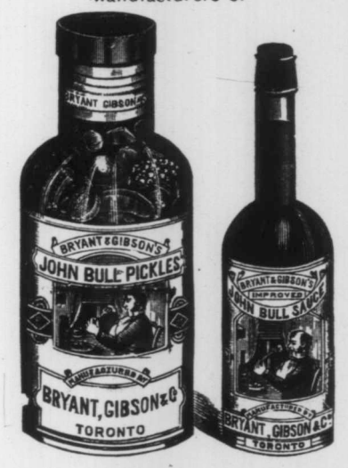
This is a facsimile of our bottles.

"Worcestershire Sauce," "Yorkshire Sauce" "Devonshire Relisb" Raspberry Vinegar, Evaporated Vegetables, Chocolates, Cocoas, Confectionery.