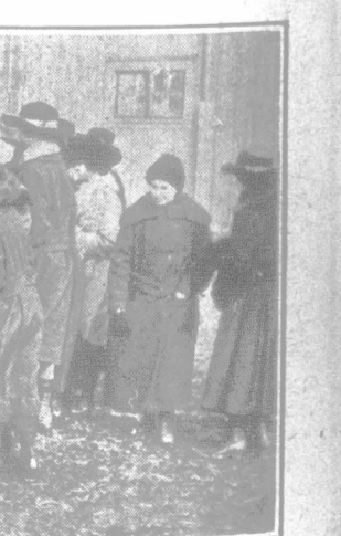
... Studying Live Stock

... fundamentals that should be ... the study of all live stock. ... at all typical dairy cows ... less wedge-shaped. This, ... ht, may appear strange for ... taken as a whole, does not ... dge. However, the general ... e cow when viewed from ... ions suggest wedges. For ... d behind a typical dairy ... she is not wider behind than ... at is, if you should put a ... against one side and an- ... -edge against the other ... ends would come together ... front of the animal's head. ... e cow is said to be wedge- ... particular, but the typical ... be viewed from two other ... the same result. If you ... these other two wedges, ... we will tell you where and ... them.