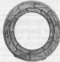
End view of Pipe and Coupling.