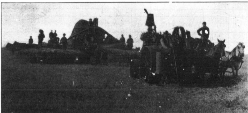
An American-Abell Outfit making No. 1 Hard.

Now, for a little adventure which we had at my place last fall. I had arranged with the fire-