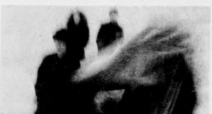
Get that camera outta my face! Or the camera person had a very shakey hand and was walking on uneven ground. Regardless of the photo, this album features a strong and varied sound which serves these Irish lads

debut album is so strong during a time of oversaturation of successful Irish rock bands. Their straight ahead emotional music comes across with the polish of a well-produced American rock outfit.