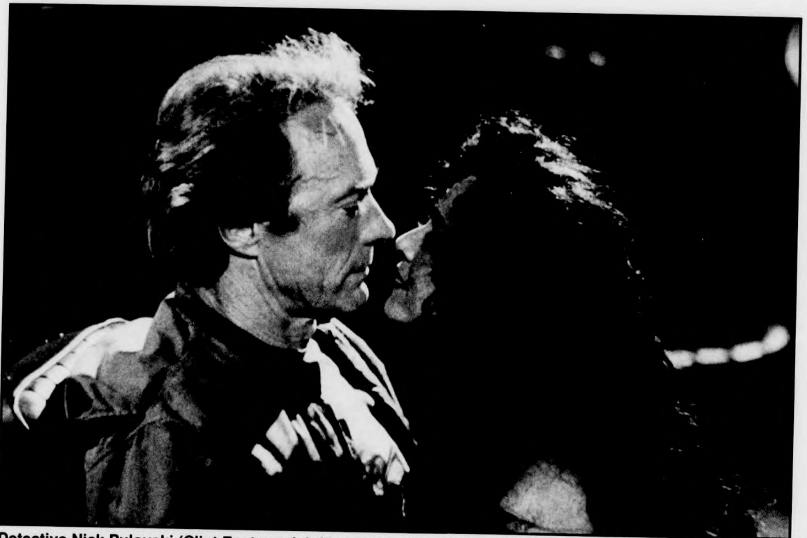
Detective Nick Pulovski (Clint Eastwood, left) gets up close and personal with one of his kidnapers (Sonia Braga).

Eastwood didn't have the advantage of a family acting tradition. He was born in San