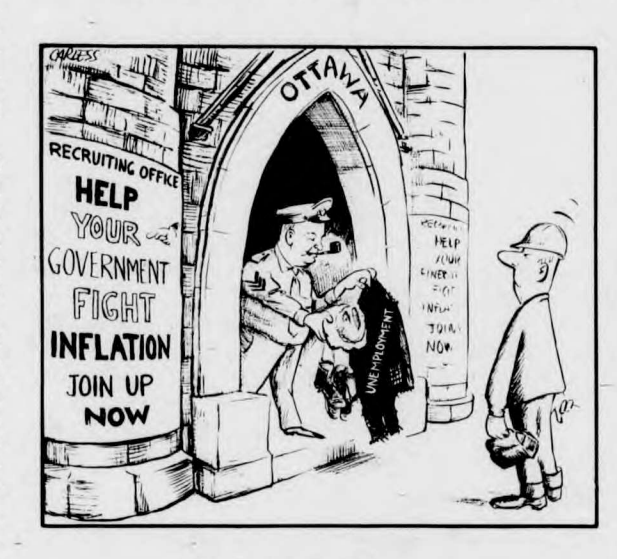
Here's your uniform.

Their program which will likely become one of