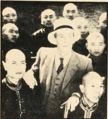
Peter O'Toole and friends in The Last Emperor to create a visual masterpiece.

The Last Emperor is the dazzling new film epic by Italian director Bernardo Bertolucci. Bertolucci, who is best known for Last Tango in Paris , has taken the story of the last Chinese emperor and used it