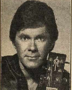
OLIVER Fri., Nov. 30 8 P.M.

Box Office 424-2298 Visa Purchases 424-3820