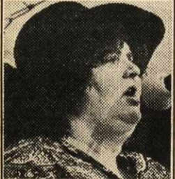
RITA MACNEIL Sat., Nov. 24, 8 P.M.