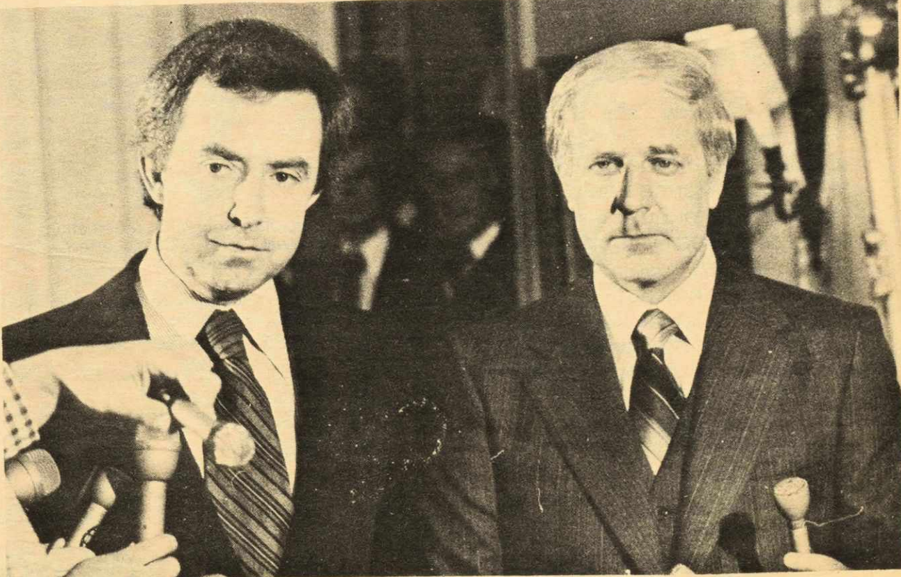
they represent the conservative united front that appears to be sweeping the country.

then shares a joke with him, as both provincial and federal parties shared a victory in Buchanan's election win