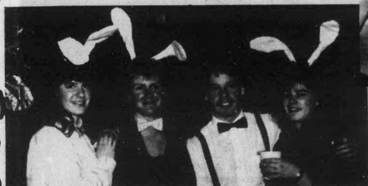
cut down trees.

Monte Carlo Night gives those attending the opportunity to gamble with vast quantities of "funny" money. Black jack, Roulette and Crown and Anchor are some of the gambling activities. And, don't forget for our entertainment throughout the night we have beautiful bunnies and some very handsome chipendales. Then at the end of the night all of the newly acquired millions are used to bid on prizes, which have