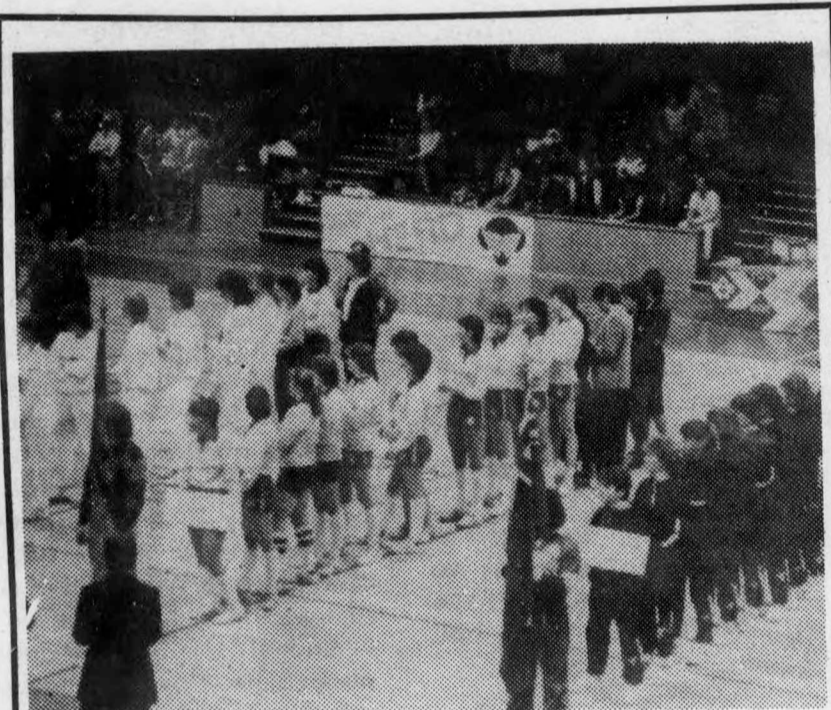
Opening ceremonies in Winnipeg.

and experience. Don't be surprised to hear more of this name in the years to come, she's for real.