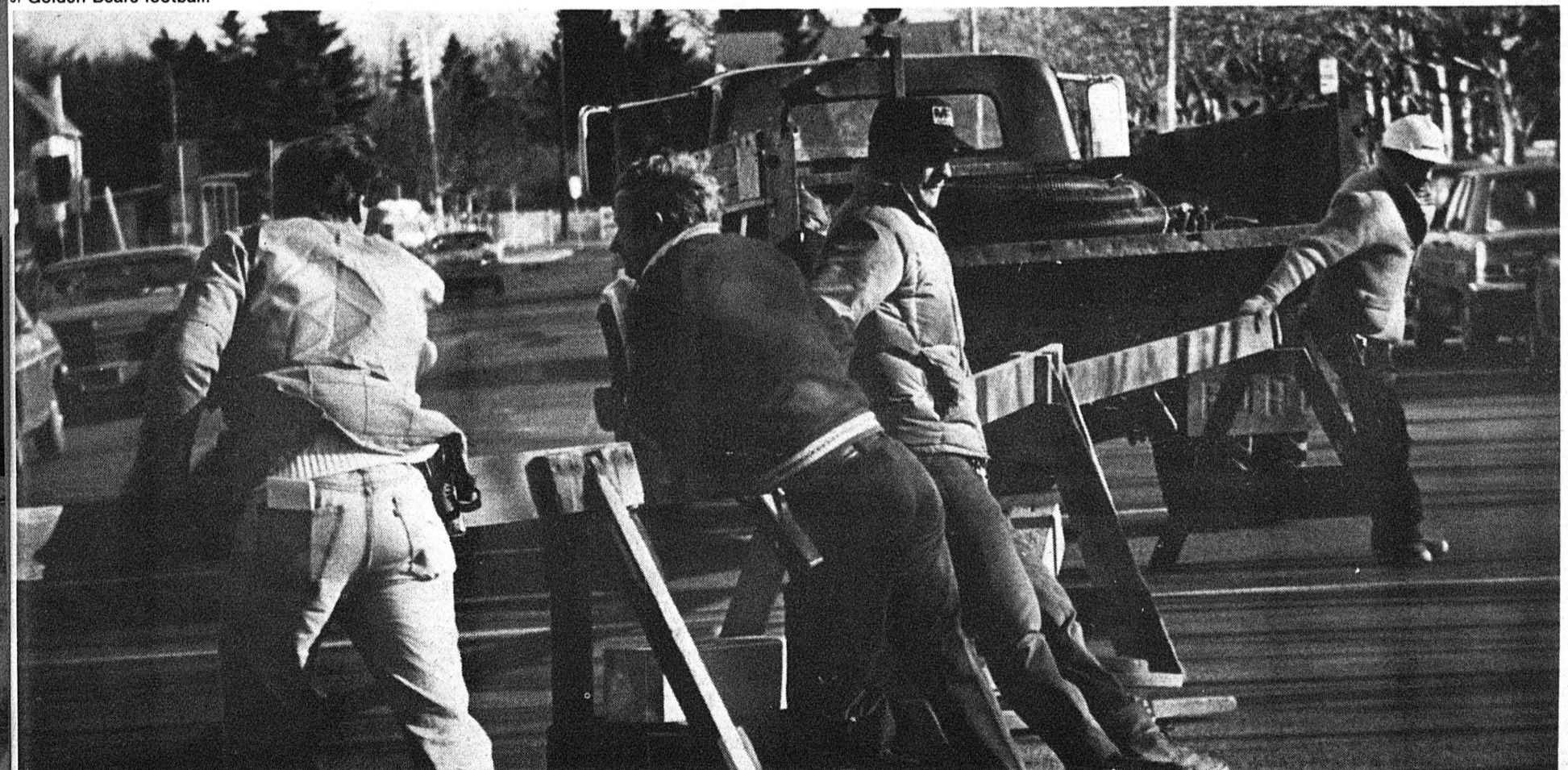
The wind blew and the concrete waved. Clinical Sciences Building concrete panels flap in the breeze (above right) as workers blocking off the street below hold-down barricades against the 90 kph gusts.