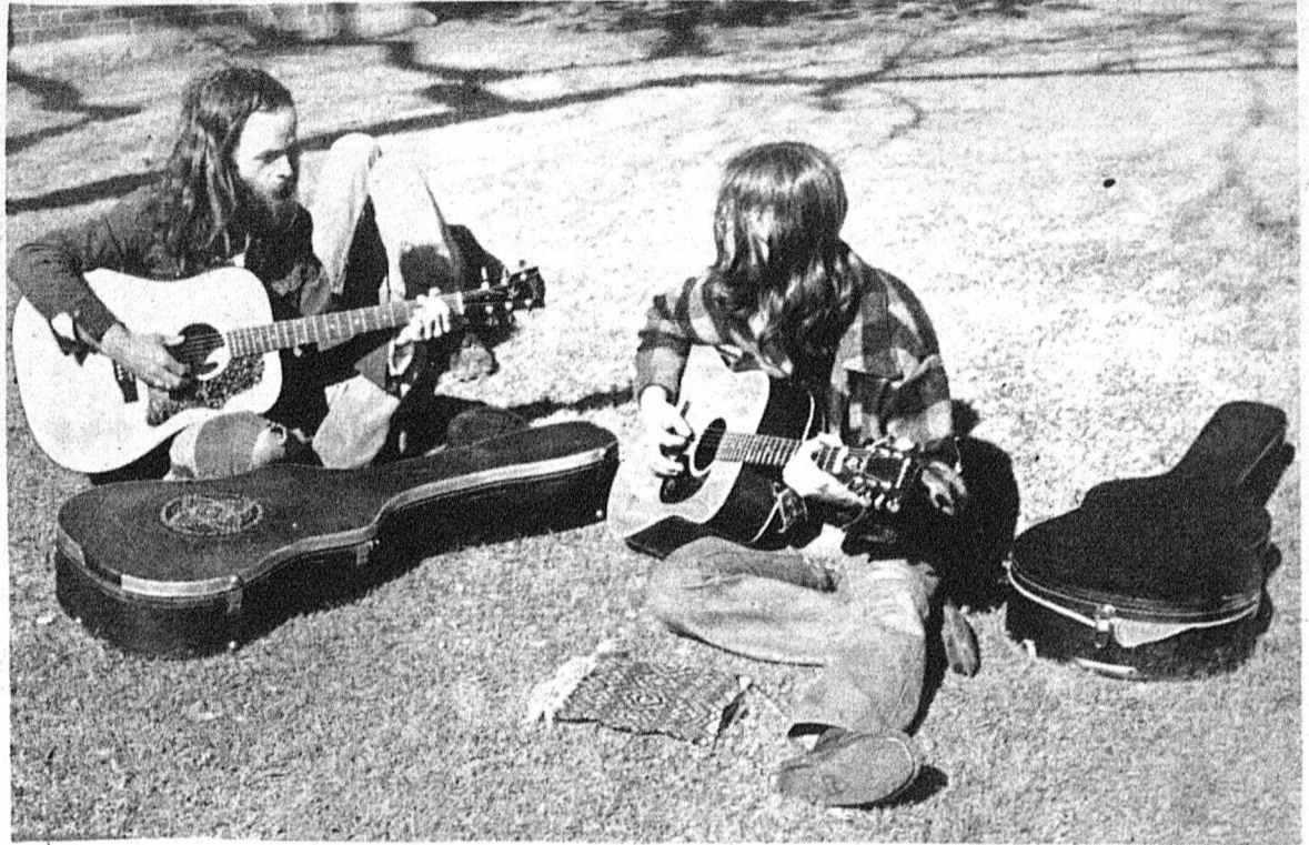
Just in time for long study hours, and thoughts of exams, the sun breaks out to disturb your concentration. Who wants to be shut up in a dusty library when you can sit on the grass, and even listen to music?