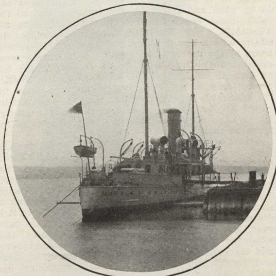
The revenue cutter "Canada," which, before the advent of the "Niobe" and the "Rainbow," was the "flagship" of the Canadian Atlantic fleet.

said a bright girl, who is working for the hospital ship funds. Everywhere, there is the evidence of naval activity, and, at night, the old-time sailor songs which Britons have sung for generations ring out over the waters.