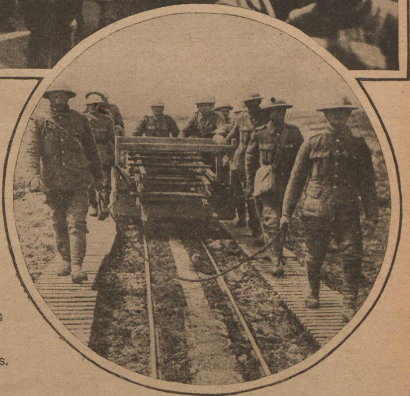
BUILDING LIGHT RAILWAYS.