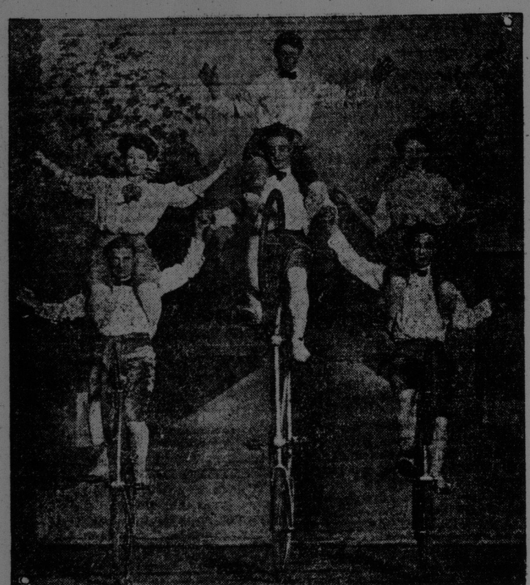
The Baker Troupe Expert Trick and Fancy Bicyclists with The Greater Norris & Rowe Circus that comes to St. John, Tuesday Aug. 24th.