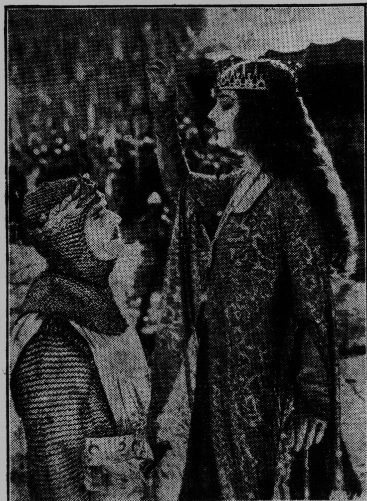
Douglas Fairbanks and Leading Lady in "Robin Hood."

Large numbers yesterday in the Opera House were transported back to the dashing times of medieval history in Old England and from the applause which greeted each climax in the big feature film, "Robin Hood," they seemed to enjoy it immensely. The story is shown in all its pomp and pageantry and carries a strong appeal from the opening to the very end. An added feature to the local showing of the picture was the incidental work of Frank T. Haezel, a St. John baritone, who sang a prelude and also a solo during the progress of the picture. The central figure of the story, the doughty Earl of Huntingdon, afterwards Robin Hood, gives Douglas Fairbanks wonderful opportunity to display his accomplishments, and he carried the part through in excellent style. The whole production is staged in lavish style and literally thousands of people appear in the screening. The expedition of Richard, the Lion-Hearted, with his faithful knights on their Crusade to the Holy Land, the atrocities