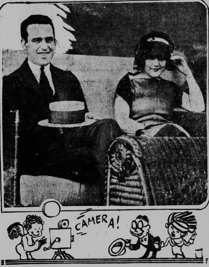
MR. AND MRS. HAROLD LLOYD (MILDRED DAVIS).

Atlantic City, N. J., July 24.—Here, ladies and gentlemen, you may discern the smiling features of two of the most prominent residents of the U. S. The young man in the picture is one of the best known young millionaires, and a keen and sagacious business man besides.