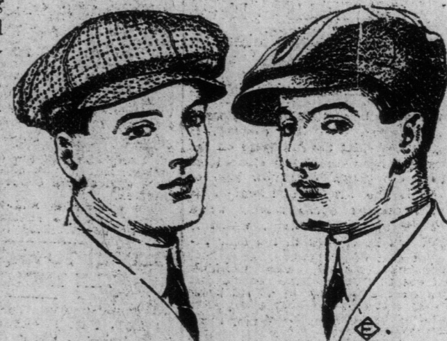
French made silk caps, in neat shepherd's plaid and checks.

At $1.25—We have had made, especially for our own trade, a golf cap of fairly large shape, especially adapted for motoring—a distinct style from those worn by chauffeurs. Beautifully made of soft, imported tweeds in delicate heather shades of greenish brown. Finished by hand throughout and with satin linings. At the same price is also a line of very dressy