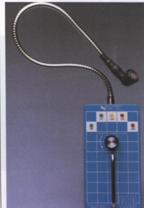
The portable, electronic Newtec gas leak detectors are fast, accurate and easy to use.

The company markets its easy-to-use gas leak detection products in North America, Europe, Asia, the Middle East and Australia.