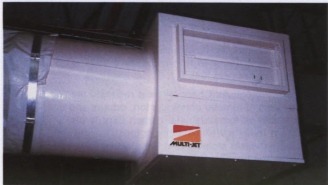
The three-in-one Multi-Jet System provides make-up air, evaporative cooling and heat recovery.

Freston-Brock Manufacturing Co. Ltd. 1287 Industrial Road Cambridge, Ontario Canada N3H 4T8 Tel: (519) 883-7128 Fax: (519) 883-4781