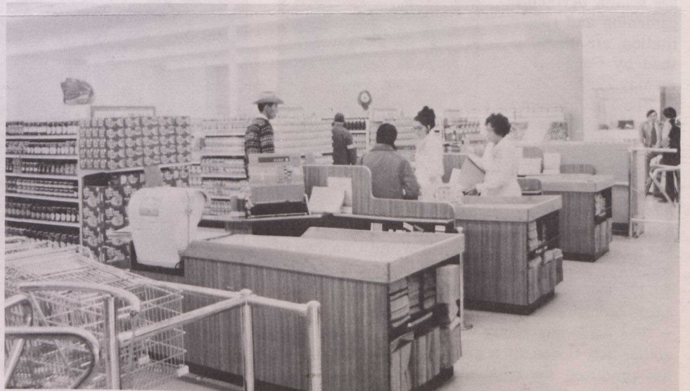
The band-owned supermarket on the Blood Reserve.

The residents forced a referendum on the spending of the other half and voted in December to divide it equally among all band members; it meant an extra $2,000 for every man, woman and child.