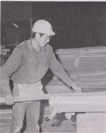
Blood reserve resident works in modular home plant.

The Blood Reserve, which covers 1,600 square kilometres southwest of Lethbridge, Alberta is home to 5,400 Indians. Although it is considered one of the more progressive in the country and has made strides in economic development, more than half its residents are on welfare and in winter the unemployment rate climbs to 85 per cent.