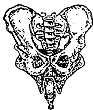
Shows pelvis as it rests on Ordinary Saddle.

Largest Manufacturers in the World of Bicycles, Bicycle Sundries and Bicycle Clothing