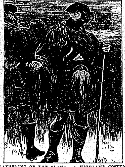
GATHERING OF THE CLANS.—A HIGHLAND COSTUME.