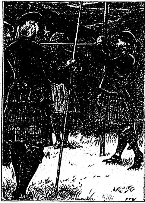
GATHERING OF THE CLANS.—JUMPING THE POLE.