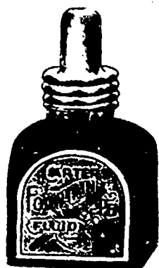
No. 242. $3.00 list per doz.