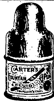
No. 517. $3.00 list per doz.

The No. 517, for travellers' use, is also a winner. It has a large bottle holding 2 oz. and a filler that takes up all the ink.