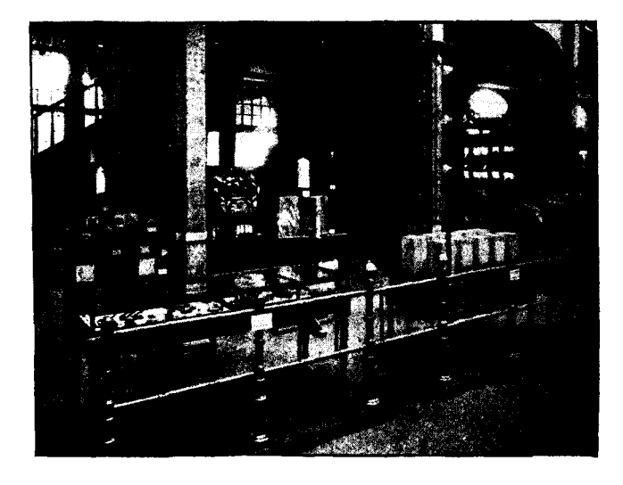
Too Like a Museum.

Copper Ores.—This collection is made up of 130 samples of which 07 come from British Columbia, 7 from Ontario, 6 from Quebec, 17 from Nova Scotia, and one from the Yukon. Native copper is represented by two specimens from Blake township and Point Mamainse, Ontario. One magnificent sample of natural copper from Atlin, B. C. is also on exhibition, having been loaned by Mr. Achille Daumont, Paris. It is undoubtedly the finest exhibit here.