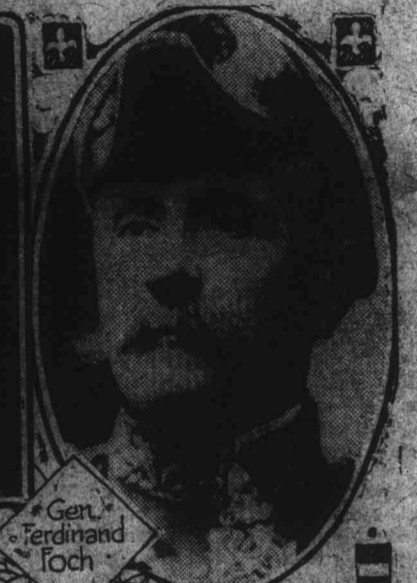
Gen. Ferdinand Foch

The two men, one the statesman and the other the soldier, one British and one French, who will live in history as the deliverers of civilization. They will be regarded as the two men who have emerged from this war as world figures for all time.