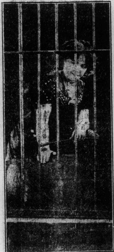
The Crowning Hit Was La Belle, the Lady of Lions.