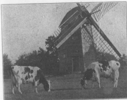
Dam and sire's dam of Dutchland Pontiac Colantha. Both are 30-lb. daughters of Colantha Johanna Lad and are two of his best individual daughters, each making world's yearly records.