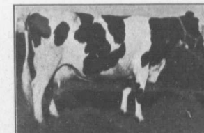
QUEEN BUTTER BARONESS , the first cow in Canada to make 33.37 lbs. butter in 7 days. She is the dam of Colantha Butter Girl, 30.87 lbs. butter and 125.23 lbs. butter in 30 days—Canadian record when made. Also dam of Queen B. H. Payne, 22.71 lbs. butter and 485 lbs. milk in 7 days at two-year-old; 35.35 lbs. butter and 2006 lbs. milk in 30 days—Canadian record when made. There will be a son of Queen Butter Baroness in the sale.

Everything will be sold without reserve, and every animal is guaranteed free from contagious diseases.