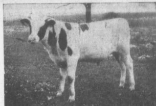
DUTCHLAND PONTIAC COLANTHA , Junior herd sire at Villa View. His entire are the finest we have ever had at Villa View, and 80 per cent of them are heifers. In the sale are ten Alcarra heifers and a 30-lb. cow, bred to this sire. His dam and sire's dam are each 30-lb. daughters of Colantha Johanna Lad.