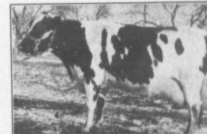
DAISY ORMSBY LASS , mature record, butter in 7 days, 31.47 lbs.; milk, 581 lbs. Three-year-old record, 24.64 lbs. butter in 7 days. Two-year-old record, 17.59 lbs. butter. She is heavy in calf to the Dutchland bull. In the sale will be a yearling daughter and granddaughter of the cow, both by the Alcarra bull.