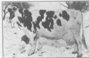
ISABELLA PONTIAC LYN —Butter in 7 days, 29.23 lbs.; a daughter of Pontiac Harness. Her 27-lb. daughter will be in the sale, also a grandson from the same daughter.