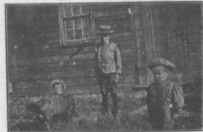
WATCHING HIM GROW

Do you want one of our PURE-BRED PIGS? If so, just pick out the breed you want and write for full particulars—using the coupon—and we shall be delighted to send you full information and supplies with which to secure the subscribers. As soon as you send the subscriptions to us, we will order your pig from a reliable breeder, who will ship direct to you, sending the pedigree papers. When you receive your pig, all you have to do is to turn it out and it will pick up practically all its living until winter. By next spring you will have a fine, full grown, pure-bred, revenue-producing pig that will be the envy of all your neighbors; and all this without any cash outlay. All we ask you to do is to secure NINE New Subscribers to Farm and Dairy at $1.00 each, and we will start the ball rolling.