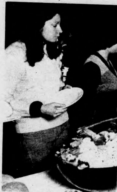
Students line up in Rill's Complex I