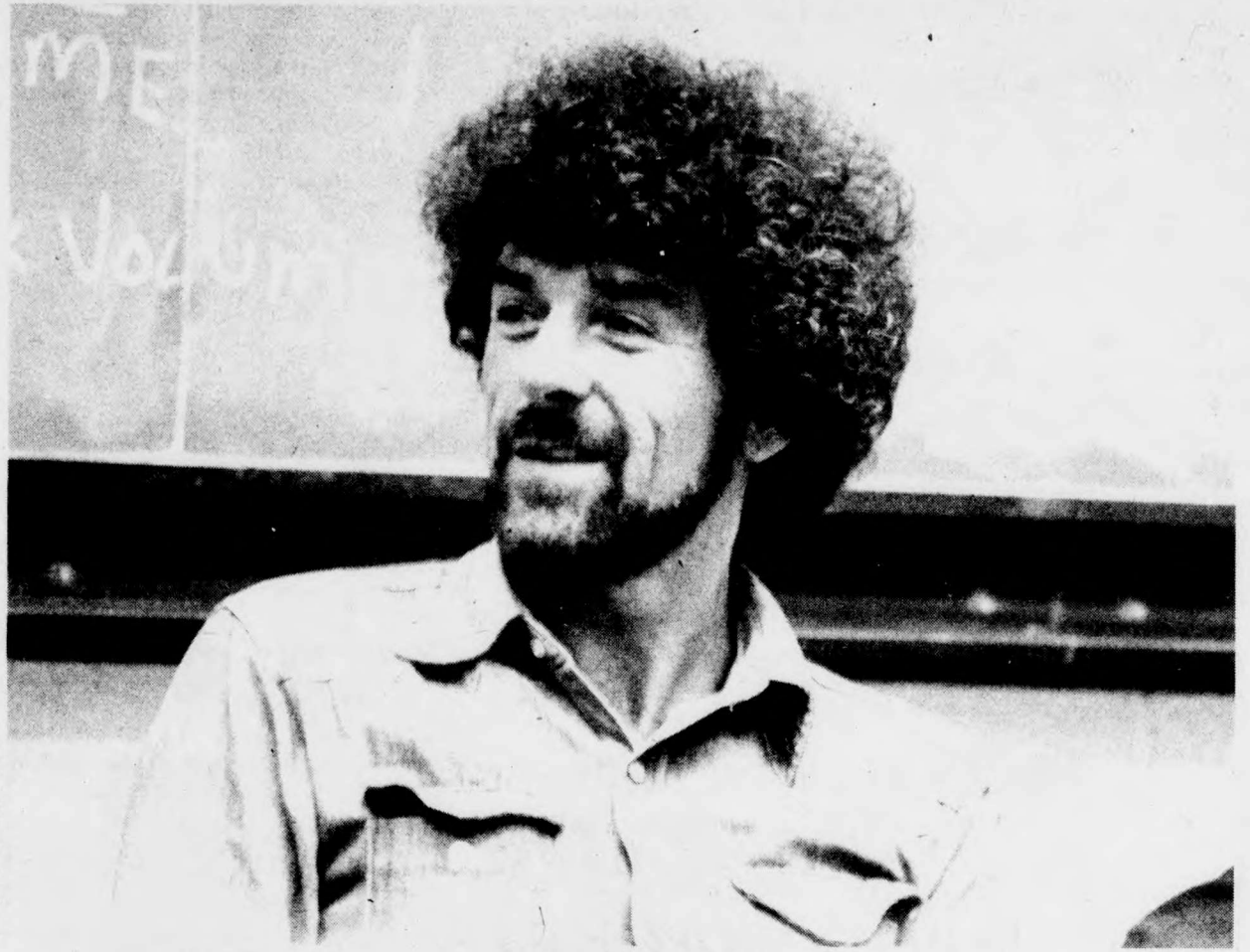
Thom Gunn at York on Monday.

Many of his poems reflected a concern for things familial. "Three" (a title for which Gunn apologized: "At least it's better than 'Poem'") was about a father and mother and their son basking nude on a beach. The son was happy and unconscious of his naked-