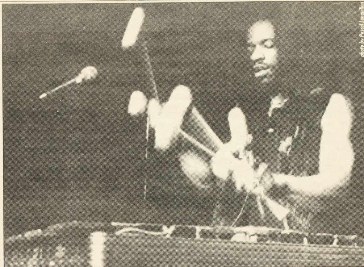
BUMP BUMP BUMP IN THE NIGHT: the Groove Collective at the Marquee.