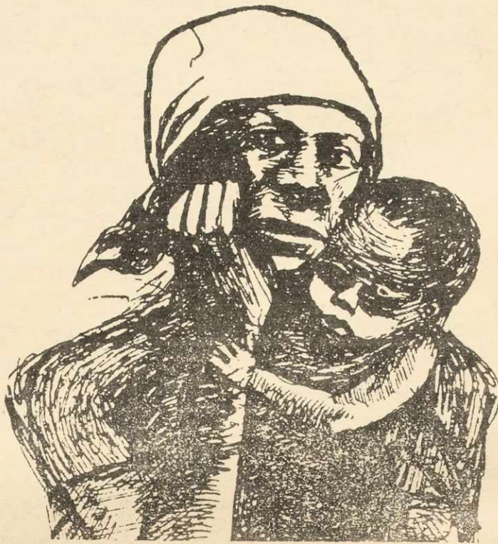
of the night — the African Woman. So much for self-praise: let us now turn to the somewhat

There were proportionately more cultural events on Southern Africa than on any other single nation on the continent. The opening event, which included a national anthem for the night, was, for instance, wholly devoted to South Africa, and involved some of our active members. Other related cultural events on Southern Africa were quite consistent with our objective, namely to popularize the people's culture in the region in a democratic manner and in all other practical ways. Indeed, on the practical side, we put up an impressive display of literature of direct relevance to the theme