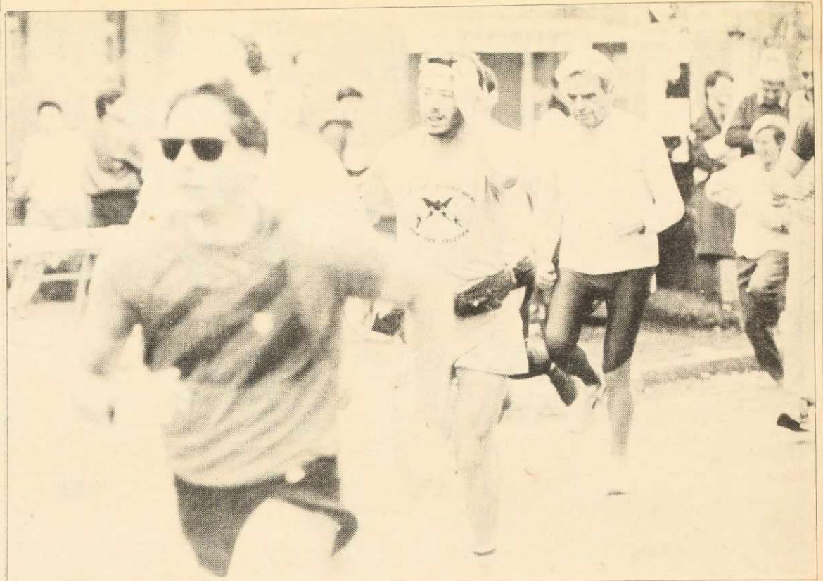
A bevy of conscientious joggers run for fun and pain in the annual Amnesty International Run for Fun to raise money for political prisoners.