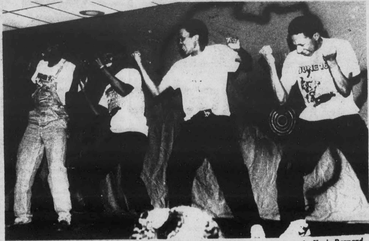
Umzabalazo in full flight, one of many Africa Night treats.

All in all a very entertaining evening in the tradition of Africa Night.