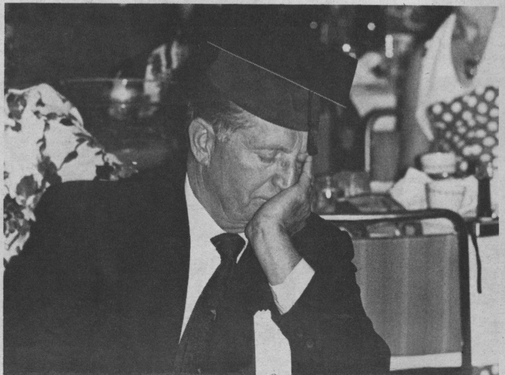
Ho-Hum, now back in the goodledaze. . .