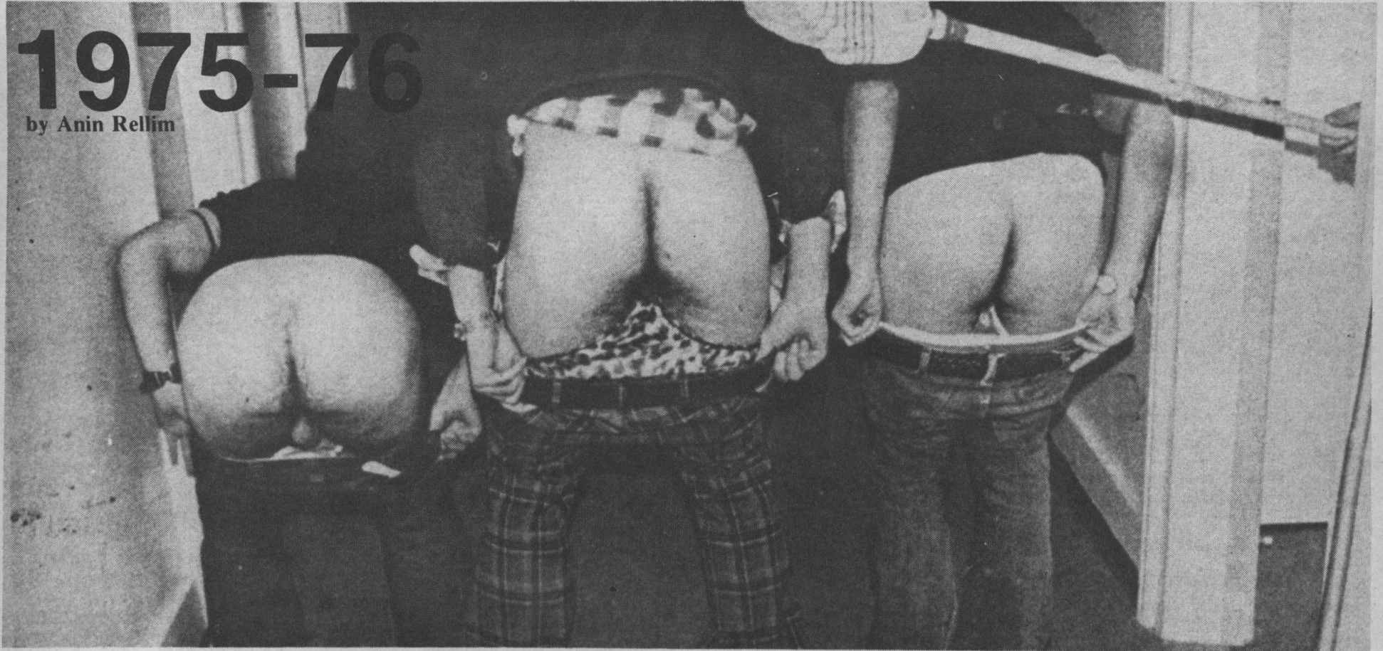
People always thought these guys were moonies — the truth comes out now — they're from St. Joseph's.

The 1975/76 term at the U of A was dead on arrival and we all know dead bodies really stink. It's usually a good idea to leave a rotting corpse alone but the old man at the Gateway Morgue told me otherwise. He said that history tells us what mistakes we are going to make — so take a good whiff of 75/76.