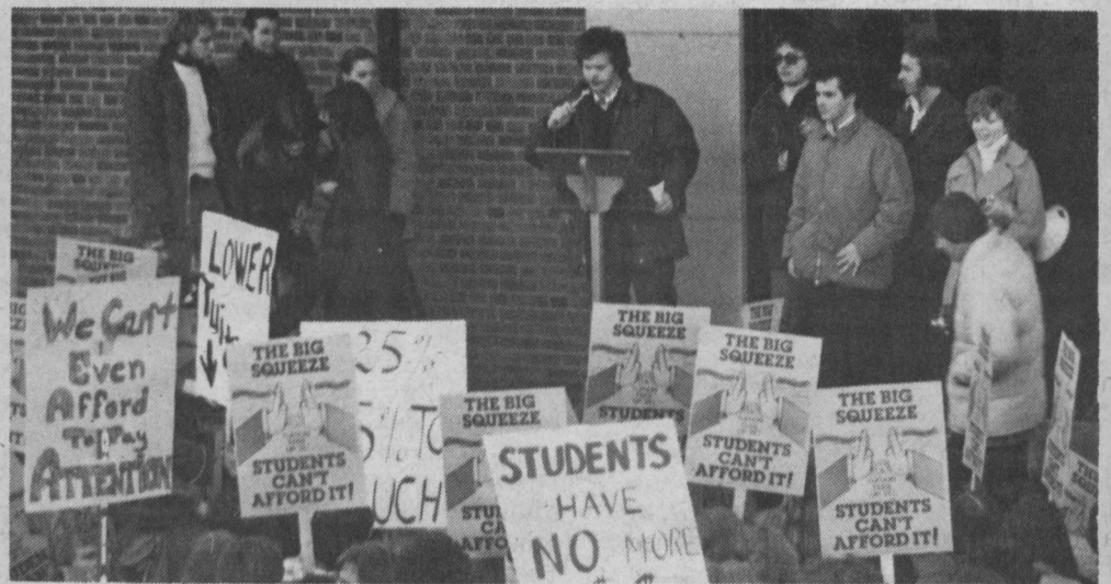
Students protesting tuition fee hikes in front of University Hall.

Pets are so hard to keep on campus. The SU had to sell HUB, their pet white elephant. He was eating too much and