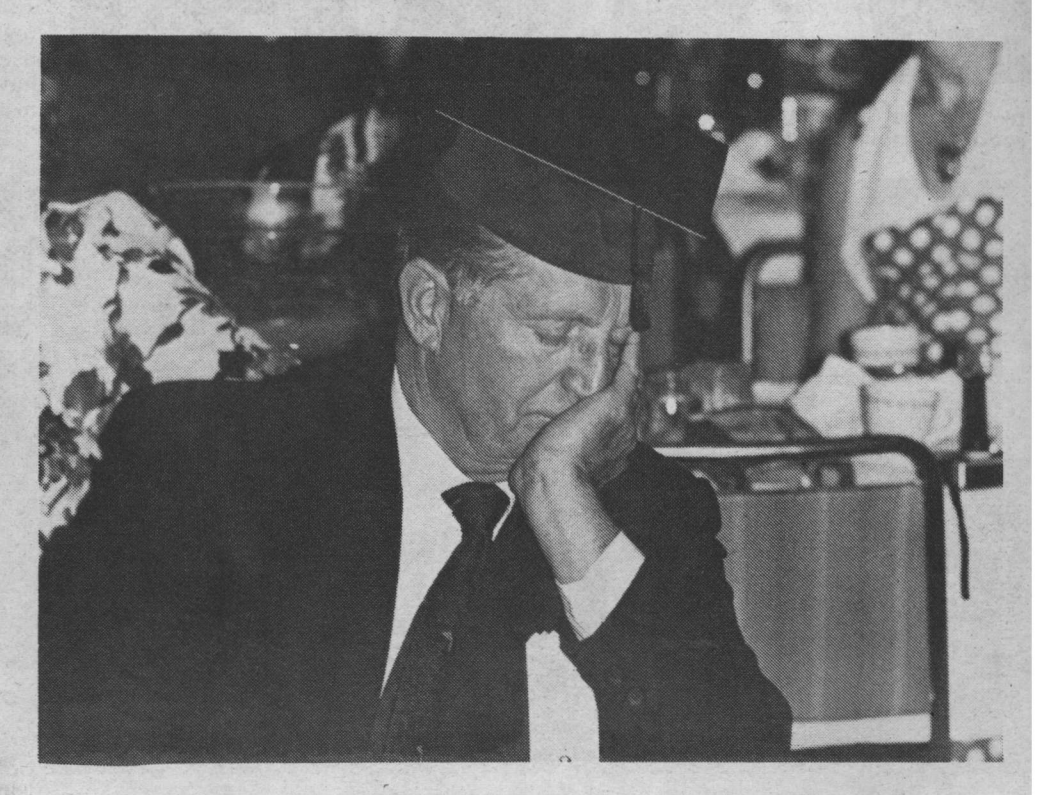
Ho-Hum, now back in the goodledaze. . .