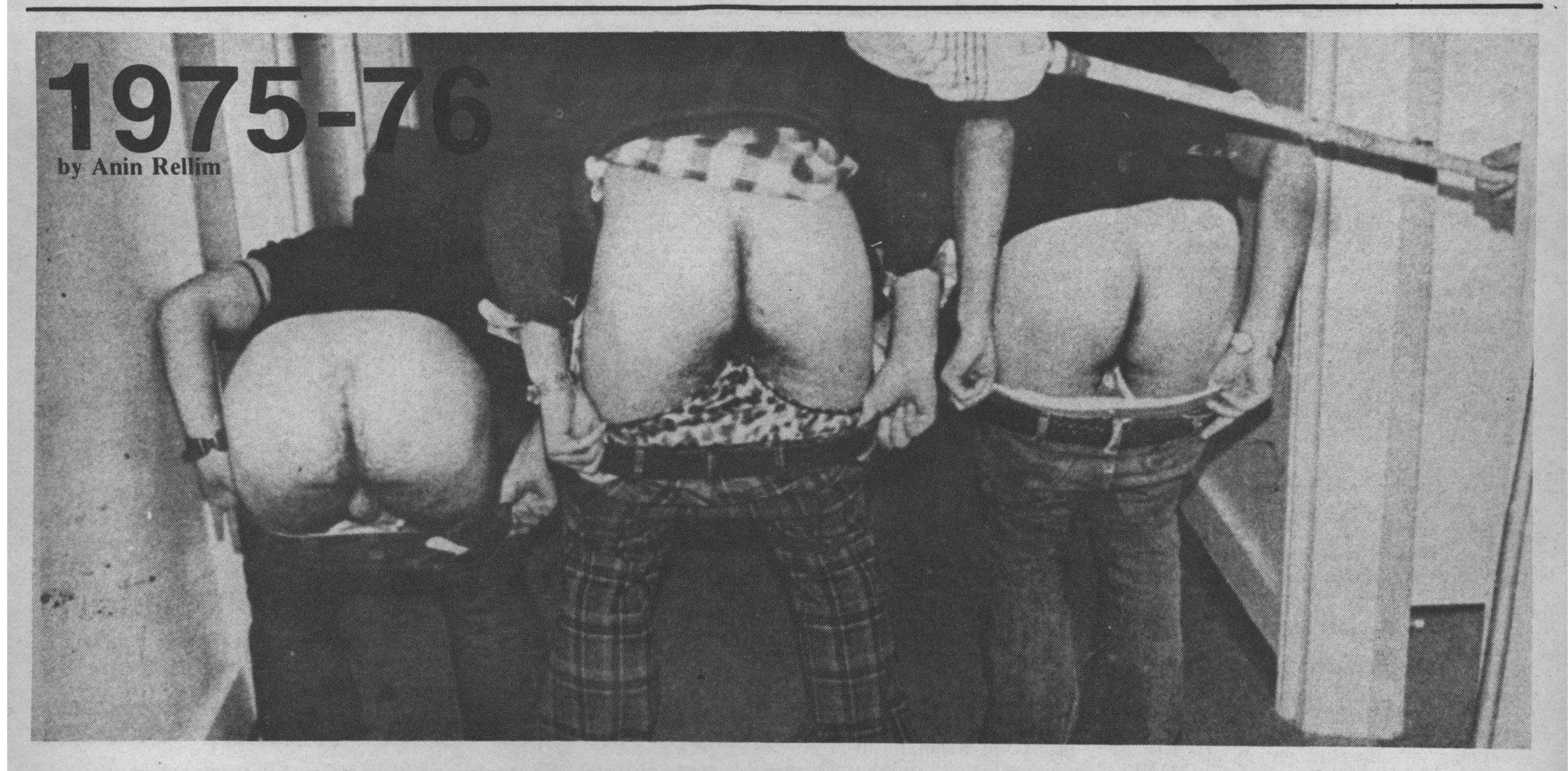
People always thought these guys were moonies — the truth comes out now — they're from St. Joseph's.

The 1975/76 term at the U of A was "A fee hike will not end the problems. dead on arrival and we all know dead Fee increases will come again and bodies really stink. It's usually a good again." idea to leave a rotting corpse alone but the old man at the Gateway Morgue told would fall in when tuition went up, but me otherwise. He said that history tells whe was silly — it was just the ceiling.