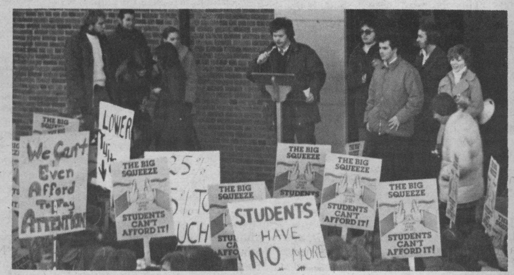
Students protesting tuition fee hikes in front of University Hall.

Pets are so hard to keep on campus. and prophet in their midst epiphanised, elephant. He was eating too much and