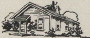
The Eureka $335.00

SOVEREIGN CONSTRUCTION COMPANY, Limited 1317 C. P. R. Building, Toronto, Ont.