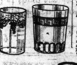
TABLE GLASSWARE. Clear Glass Vases .... Thin Glass Tumblers, each ..... Key Design Tumblers, each Colonial Glass Table Sets. Monday,