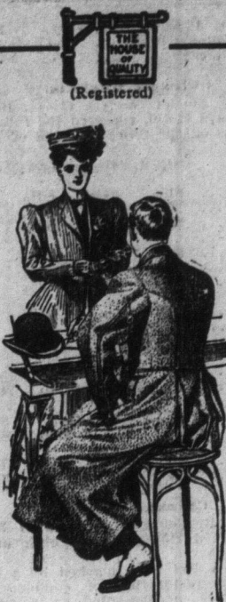
The selling of Hart, Schaffner & Marx Fine American Clothing