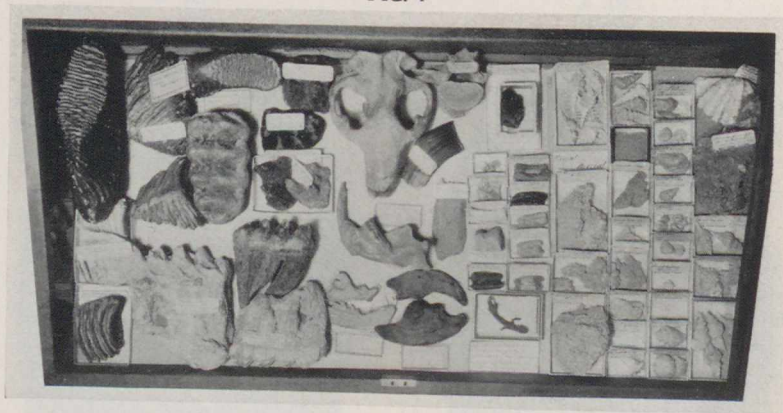
REDPATH MUSEUM: Forty-year-old case showing crowded, ill-arranged and poorly labeled collection.—(See page 19).