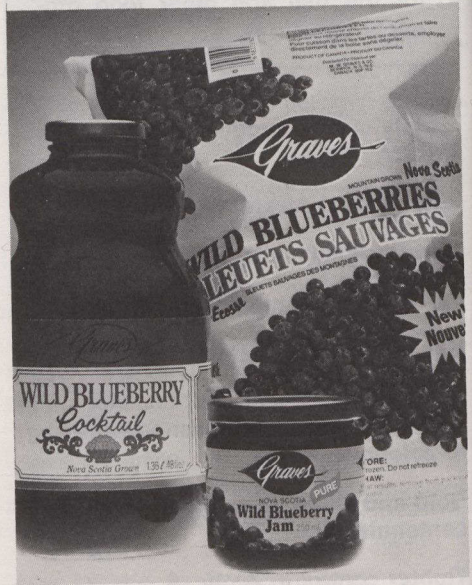
Cobi Foods in one of Canada's major fruit and vegetable canners.