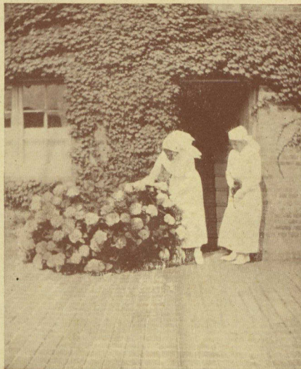
Just outside the Nurses' Cottage.