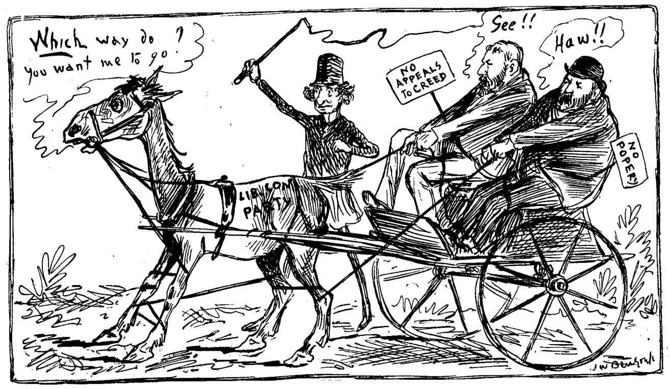
SOMETHING OF A TANGLE.