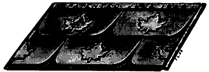
Patent Safe Lock Shingle.