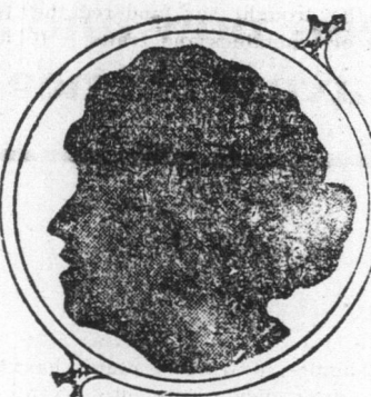
POSE OF LARGE WOMEN.

When a kitten curls itself up on a cushion we say it is cute, but we would laugh at the Newfoundland dog if he tried the same pose. Both animals are lovely and artistic in their own ways.