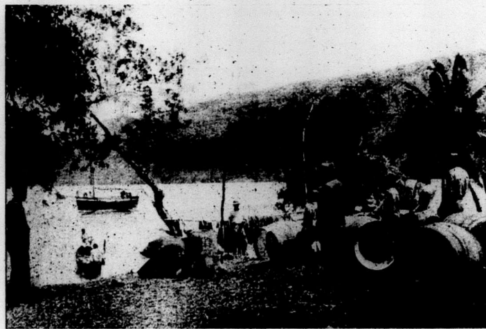
A Shipment of "Sovereign Lime Juice" waiting to be carried by boat from shore to steamer.

suggests a tropical richness and flavour which a drink of it confirms. It is the pure juice of the ripe, sound Lime Fruit. The Dominion Government Analyst reports it to be absolutely pure, and without coloring matter, and this we guarantee, as we control the juice from the tree to the bottle. Only two teaspoonfuls of "Sovereign Lime Juice" are required to make a glass of the most delicious, refreshing and economical summer drink.