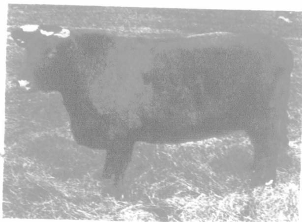
IMP. EMPRESS 12TH. First prize, Royal Show, 1900.